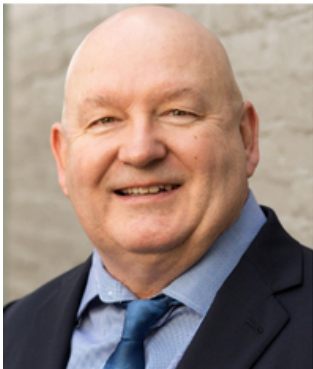
Ken Hill US House 4