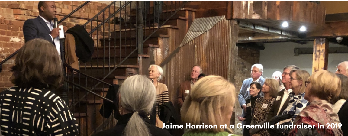
Jaime Harrison at a Greenville fundraiser in 2019

My first experience in South Carolina politics came when I attended a meeting held by the SCDP in early 2015. At the time there was a young, energetic, and brilliant chairman who was leading the party.