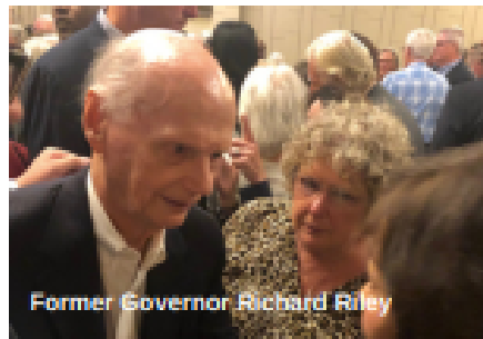
Former Governor Richard Riley