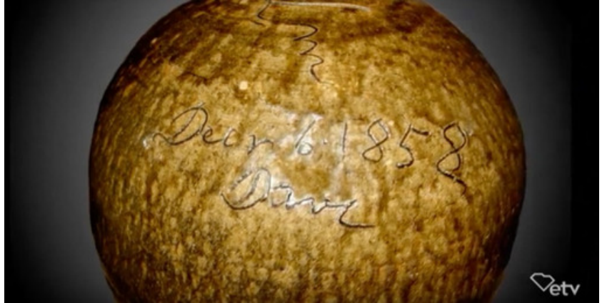
The work of David Drake, an American artisan and enslaved person, has intrigued historians. In 2016, he was enshrined in the South Carolina Hall of Fame .

This list is certainly not everything. But we encourage you to take advantage of the opportunities throughout the state and the county to immerse yourself in the richness of African-American history in South Carolina.