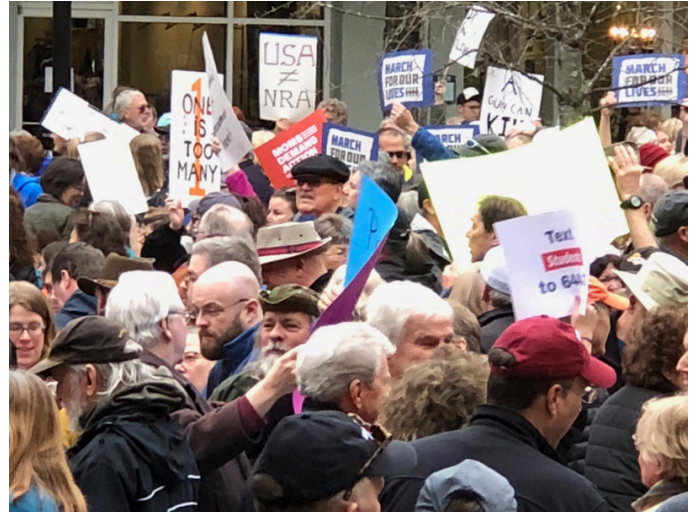
Nearly 2500 Upstaters gathered in downtown Greenville to March for Our Lives last March.