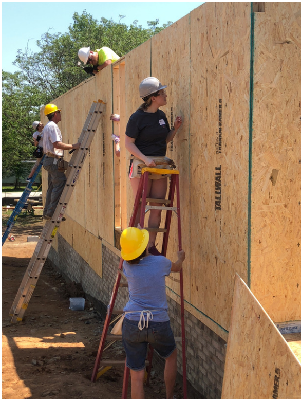
Members of Democratic Women at work.

Democrats build strong communities. Sometimes with policy, sometimes with sweat equity. On May 12, a crew of more than a dozen members of Democratic Women of Greenville County and the GCDP executive leadership, rolled up their sleeves and worked on a Habitat for Humanity Women Build project at Mulberry Street.