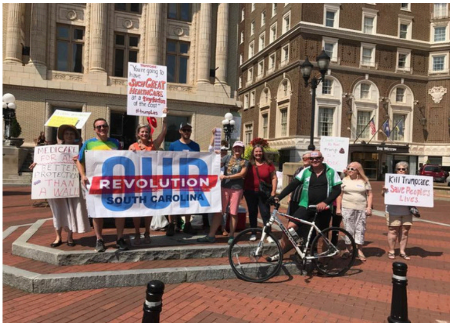
Organizers gather for weekly demonstration.

The work of the Greenville County Democratic Party is made possible by the contributions of donors like: