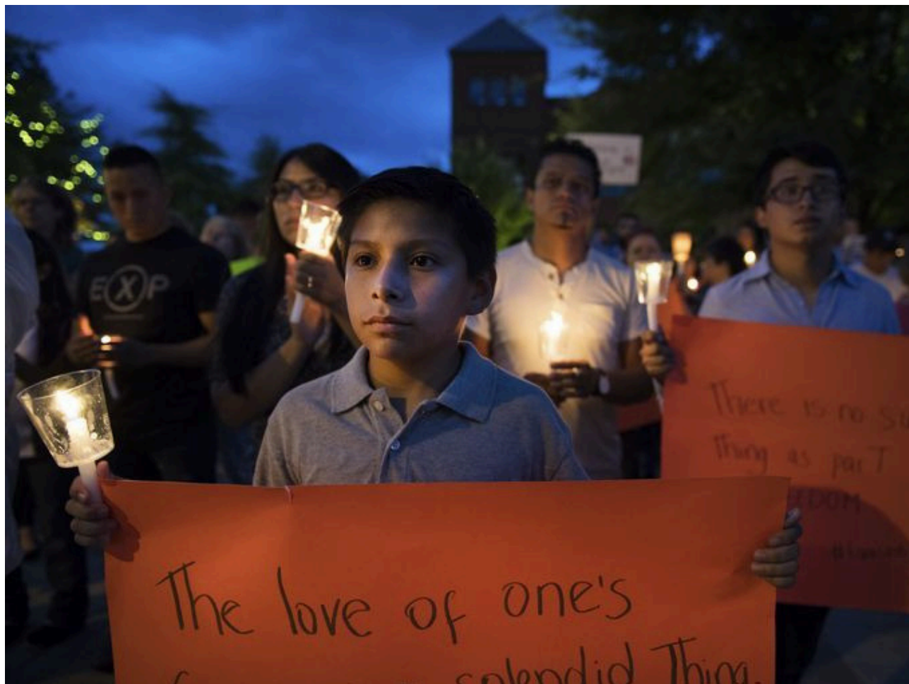
Organizers gather in support of DREAMers read more on page 3

The latest news and updates from the Greenville County Democratic Party