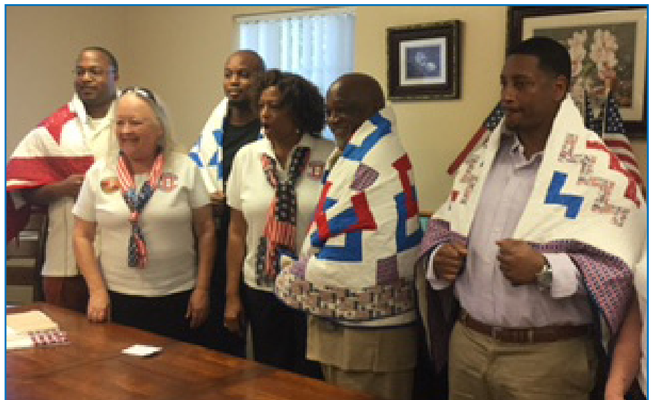
The Flemming Family at Quilts of Valor Ceremony

Anyone may request a quilt for a loved one at ( http://www.qov.org/request-qov/ ). It takes several months to make each quilt because volunteers sew each patch together by hand.