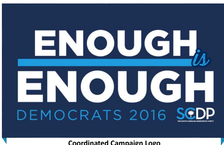
Coordinated Campaign Logo