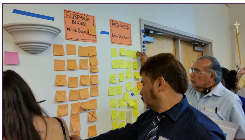
Identifying expressions of White Supremacy and Anti-Blackness in the Southeast