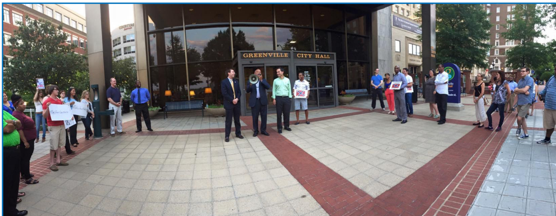
S.C. Senator Carl Allen address attendees during peaceful demonstration at Greenville City Hall