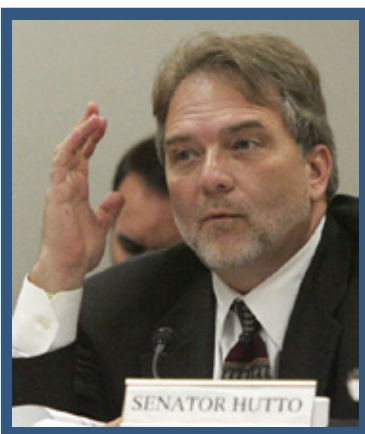
U.S. SENATOR: Brad Hutto http://www.bradhutto.com