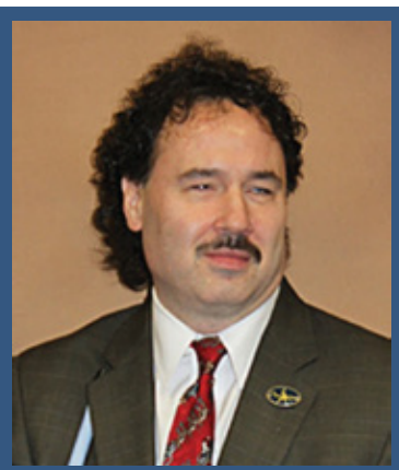
ATTORNEY GENERAL: Parnell Diggs http://twitter.com/parnelldiggs