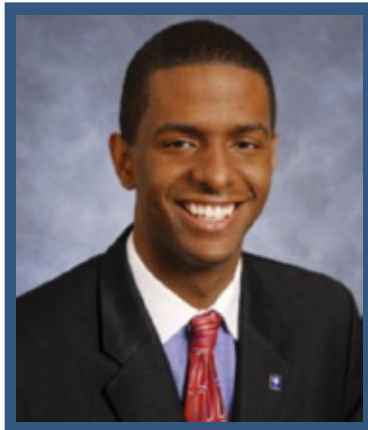
LIEUTENANT GOVERNOR: Bakari Sellers http://www.sellers2014.com