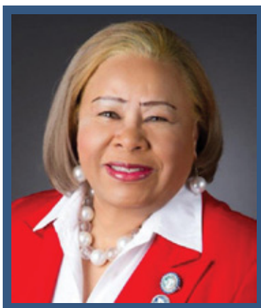
U.S. SENATOR: SPECIAL ELECTION Joyce Dickerson http://joycedickersonsc.com