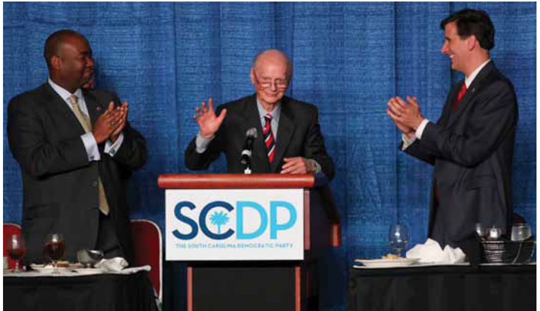
S. C. Democratic Chairman, Jaime Harrison; former governor, Richard Riley and gubernatorial candidate Vincent Sheheen at the Jefferson-Jackson Dinner at the Columbia Metropolitan Convention Center during the 2014 Democratic Convention Weekend recently.